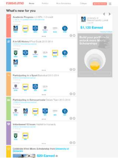
The home page contains a live feed of all their earnings